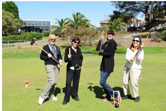
The fearsome foursome