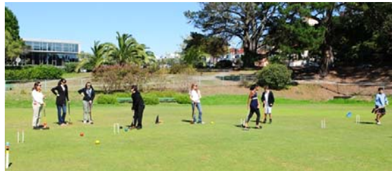
PWN on the Stern Grove croquet lawn

We had a fantastic turnout at our croquet fund-raiser! Seventeen people turned out, including spouses and children. We had such a good time, we're planning to make this an annual event!